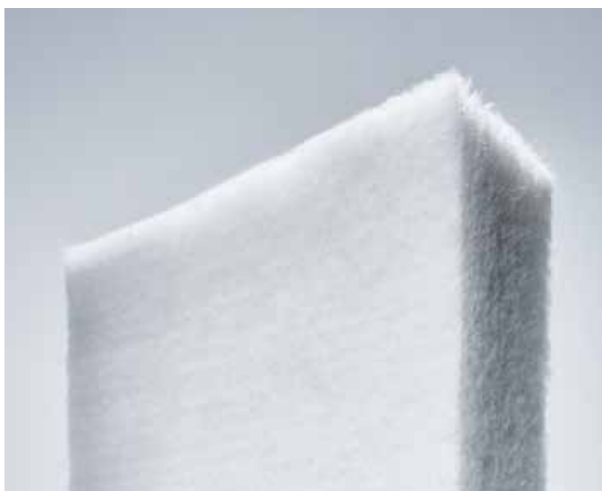
Acoustica High Density

22 kg/m 3 , 28-32 kg/m 3 , 44-48 kg/m 3 and up to 60 kg/m 3 with thickness from 25mm to 100mm and widths of 430 to 1200mm.